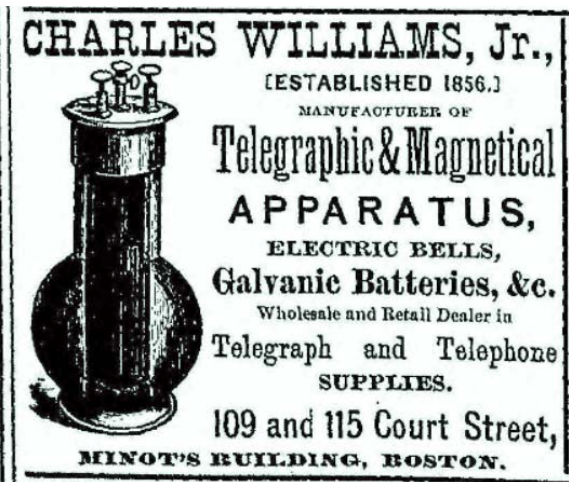
1883 Boston City Directory