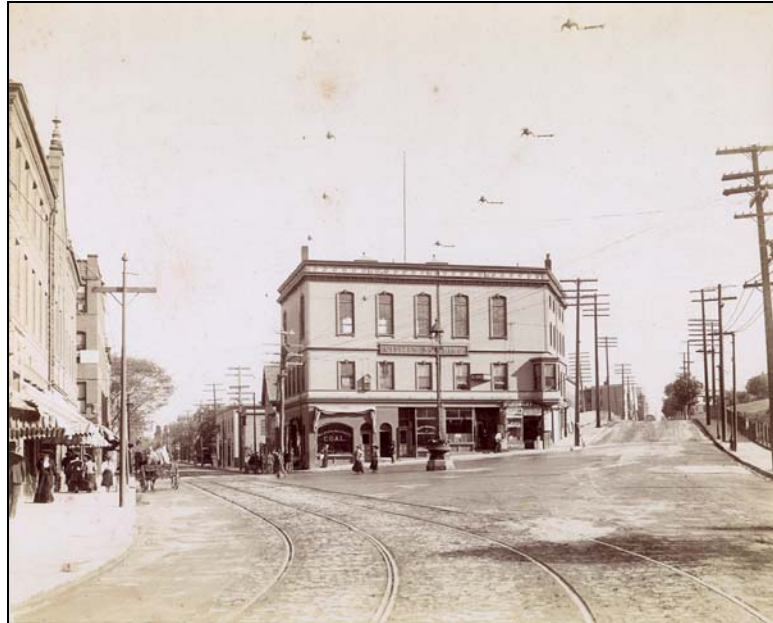
Citizen Building, Gilman Square circa 1910